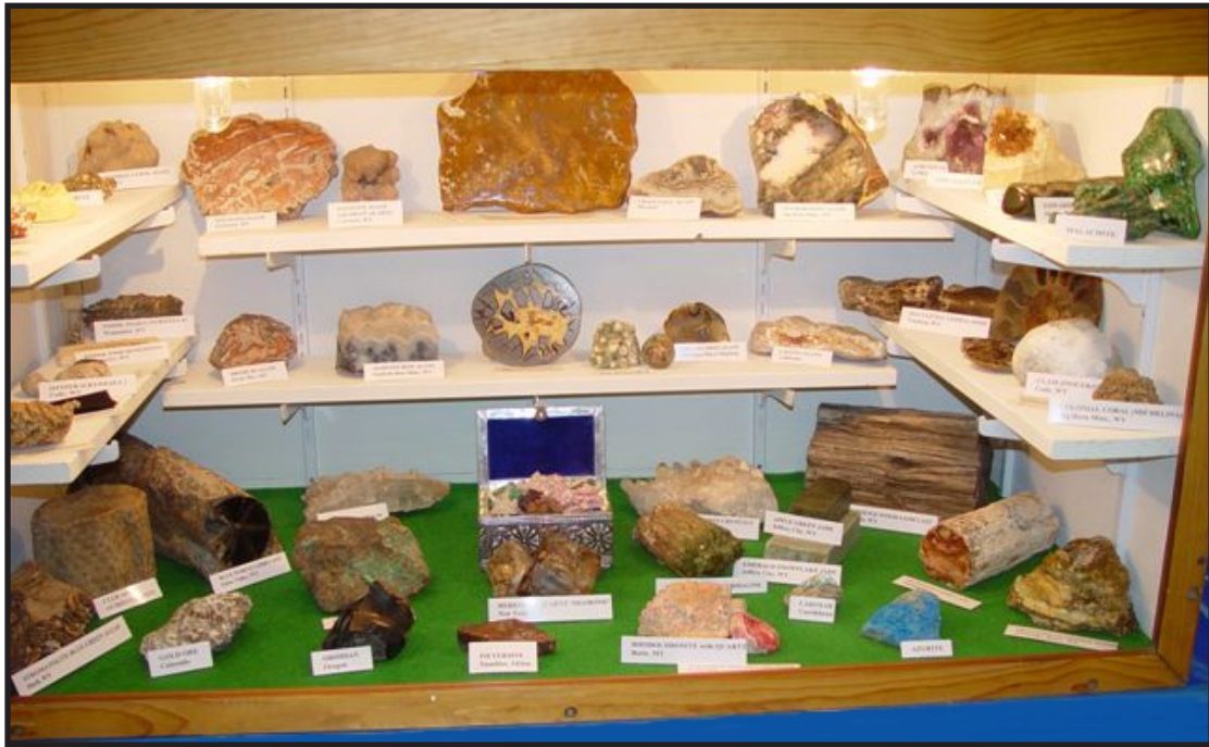
The Cody 59'rs won the People's Choice Award

Hosted by Cody 59ers Rock Club/Assisted by the Shoshone Rock Club