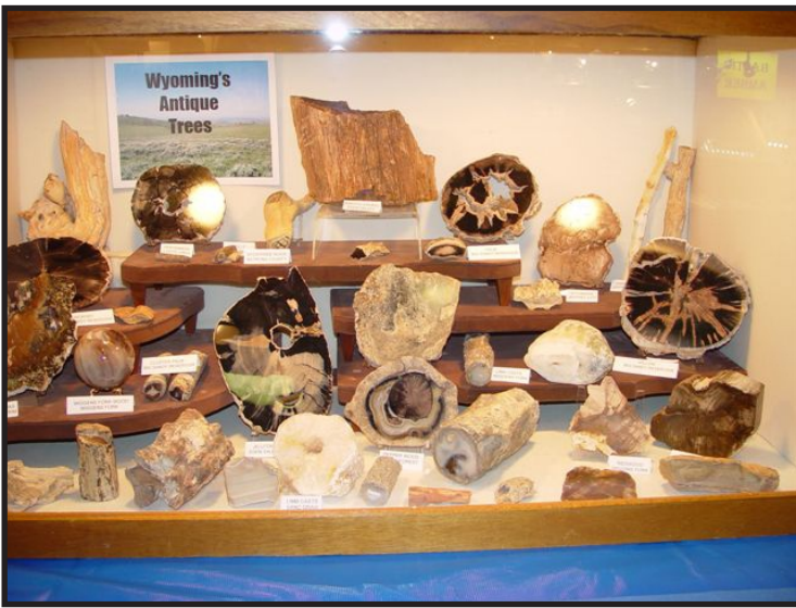
The Riverton Club won second place in the club case competition at the State Show with their case displaying Wyoming's Antique Trees .