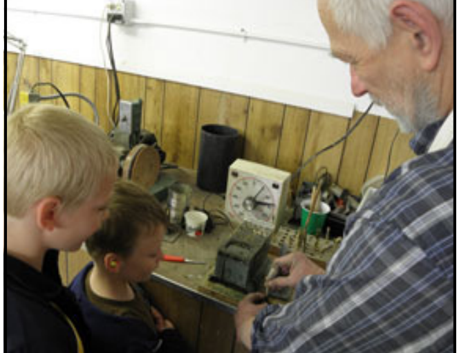
Members of the Natrona County Rockhounds working and teaching in their clubhouse.

"There is some dispute, er discussion, in our club right now about kids in the machinery areas- "totally NOT" versus "with supervision" which of course will come to a head if you publish the kid photos. Not to worry, we will get it hashed out. I thought they made better pictures."